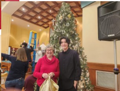
Makeover for courtyard and Hanging of the Greens!

Sunday, December 9, 2023, Central invited our members and friends to join us for a Christmas Luncheon along with some of our community partners from the YMCA, IBE and CFAA.