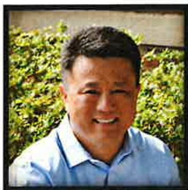
Hello Central Family & Friends,

The school is out for the year and that means summer break has officially begun. I hope your children and grandchildren had a fruitful and productive school year and looking forward to a summer filled with fun and relaxation. Before you know it, "Back-to-School" will be upon us. During this summer, as you make plans to travel and spend time with your family & friends, make plans to draw closer to God in times of worship, praise, and prayer. When we possess the indwelling power and presence of the Holy Spirit, God will fill our hearts, minds, and lives with unshakeable hope amid our struggles and challenging circumstances. Paul tells us in Romans 5:5, " Hope does not put us to shame, because God's love has been poured into our hearts through the Holy Spirit who has been given to us. " I pray that this summer will be your opportunity to encounter and experience the indwelling power of the Holy Spirit in your journey of life and faith.