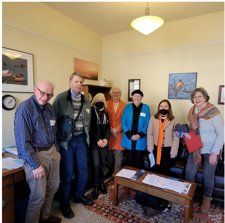
Bethany members at the Interfaith Advocacy Day in Olympia.