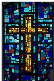
By the Cross We Care One Person at a Time