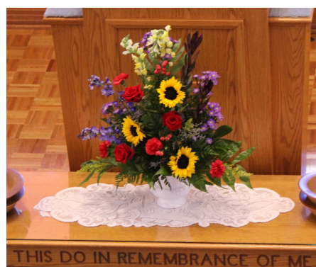
In honor of the Stubblefields