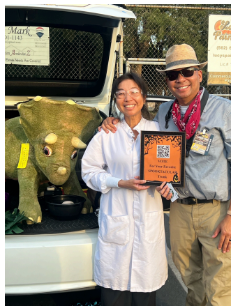
The Rangitsol Family