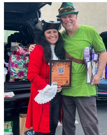
The Erdman Family