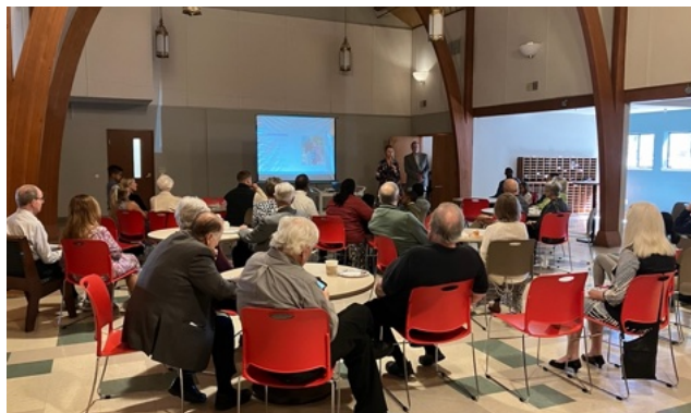
Presentations at numerous congregations in both northern and southern California included three shown here: St. Paul Lutheran Mountain View (above), Our Savior Lutheran Livermore (below left) and Trinity Lutheran Burlingame (below right).

Over the past few months, I've been blessed with numerous opportunities to discuss my ministry in East Africa with supporters throughout the United States. Starting in April, I visited several congregations to present my work, with a special focus on the Project 24 child sponsorship program. It was heartening to reconnect with familiar faces and to meet new congregations eager to learn about our mission efforts. Through these interactions, people have been able to actively engage in our mission through financial support and prayers for