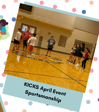
KICKS April Event Sportsmanship