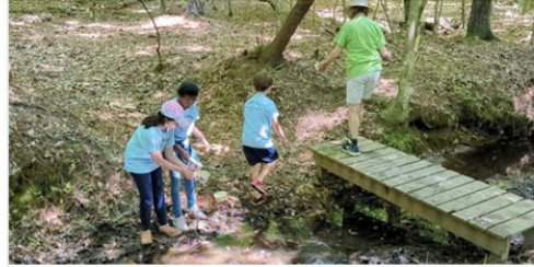
Outdoor education at its finest in fourth! 🌳 🍃