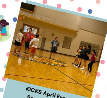
KICKS April Event Sportsmanship