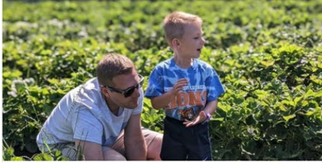
Junior kindergarten fun in the strawberry patch 🍓