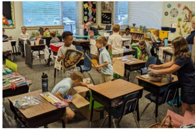
Entrepreneurs Day in 2 nd Grade!