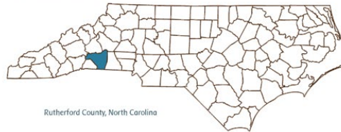
Rutherford County, North Carolina