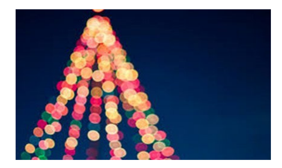
Pastor's Corner for November 26-December 2

First Sunday in Advent November 26, 2023