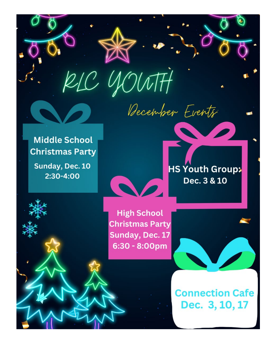
Youth Ministry Middle School and High School

All events are located in The Warehouse (Room 253), in the Family Life Center, unless noted.