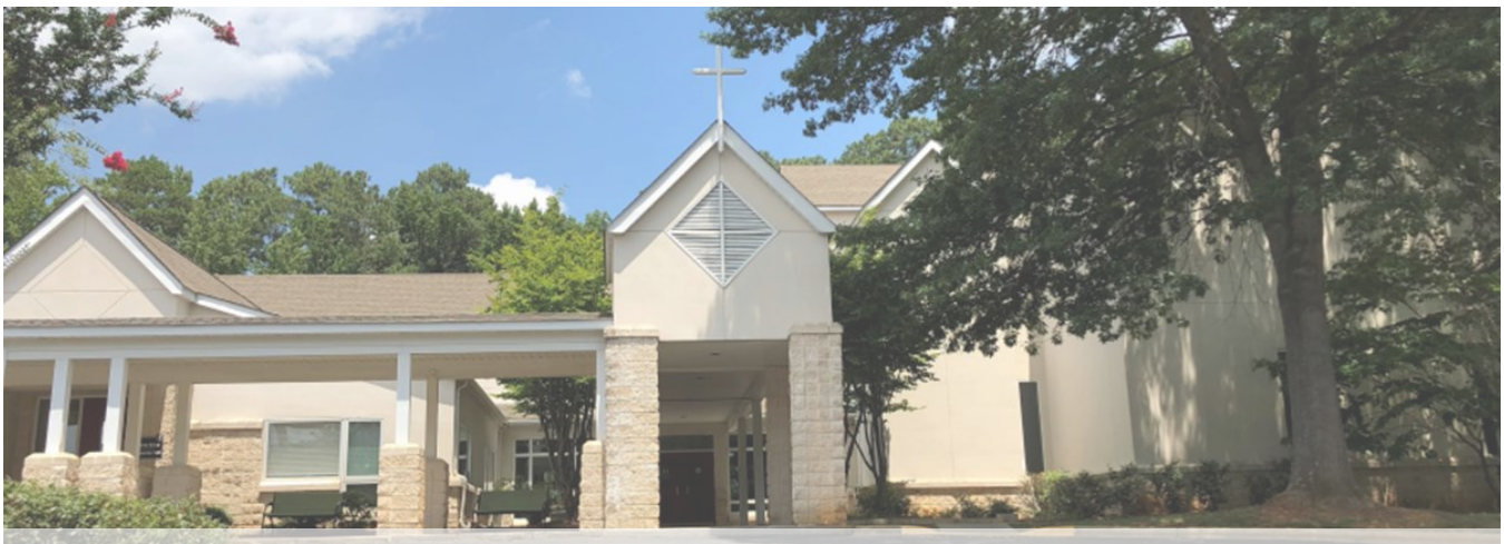
MONTHLY NEWSLETTER OF RESURRECTION LUTHERAN CHURCH