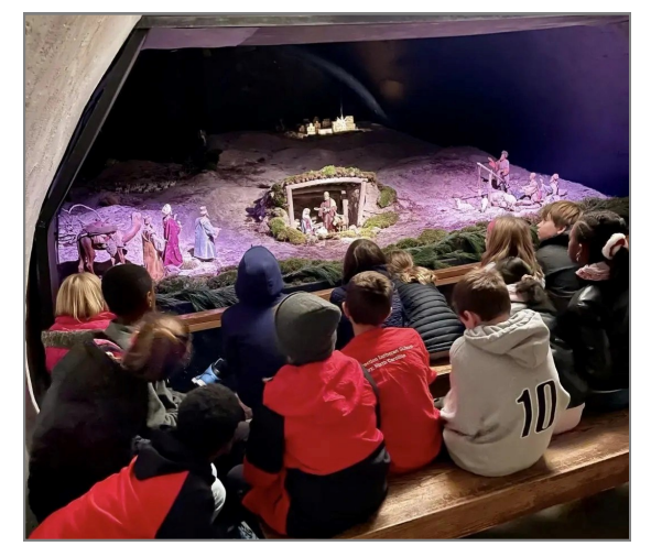
5th Graders Spend the Day Walking Through History!

Mission: Resurrection Lutheran School is committed to educating generations of children in the training and instruction of the Lord. Because of this commitment, we will provide a Lutheran educational experience that is Christ-centered, as well as academically focused for children in junior kindergarten through eighth grade.