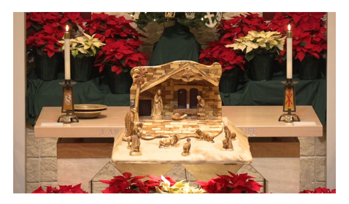
Pastor's Corner for December 24-30