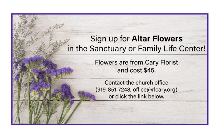
Sign Up Online Here!

We encourage you to find areas of interest that best suit your natural gifts, and join us as we reach out with the love of Christ, by grace, through faith, for service.