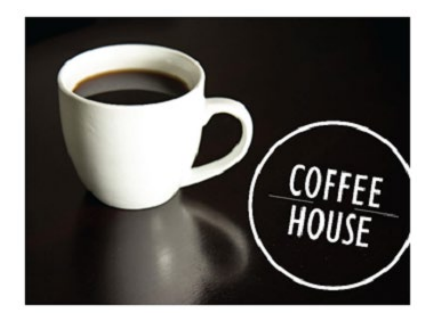
Sign Up: https://bit.ly/3kqoHGN

We need Setter Uppers at 5:30 pm (both food and room), Servers at 6:30 pm, and Cleaner Uppers at 8:30 pm.