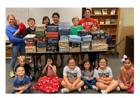
Thanks to all who participated in the Christmas shoe box project. Our gifts were sent to children in Peru and Colombia.