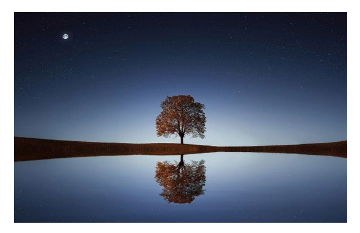
Pastor's Corner for January 21-27, 2024