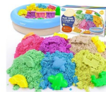
Kinetic sand or play dough

Vacation Bible School ~ June 24-28, 2024