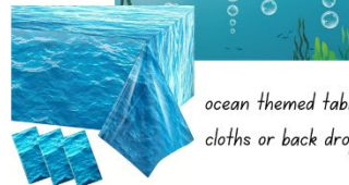
ocean themed table cloths or back drops