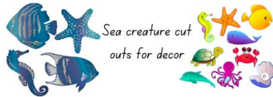
Sea creature cutouts for decor