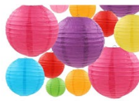
paper lanterns - any color