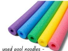
used pool noodles - any color