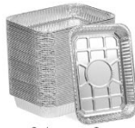
foil pans for science experiments