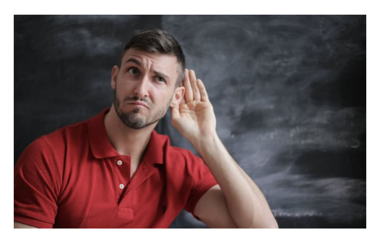
Pastor's Corner for February 11-17, 2024