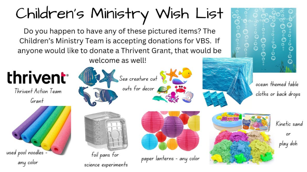
Vacation Bible School ~ June 24-28, 2024

For dates and to sign up: https://bit.ly/3ZVhyB8