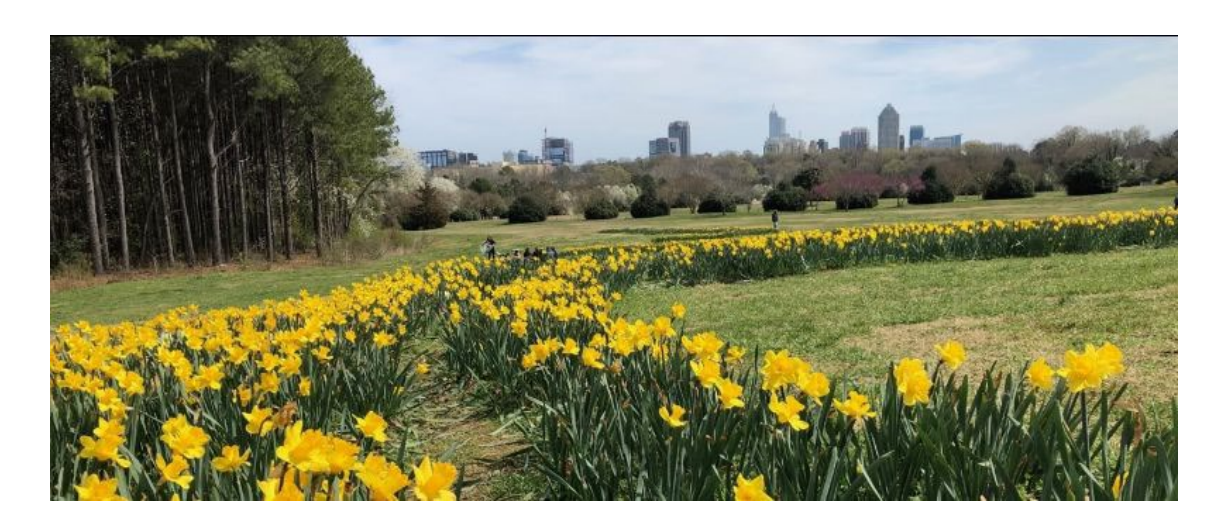
Pastor's Corner for March 3-9, 2024

What a 2-Year-Old Taught Me (1 Corinthians 1:18-31)