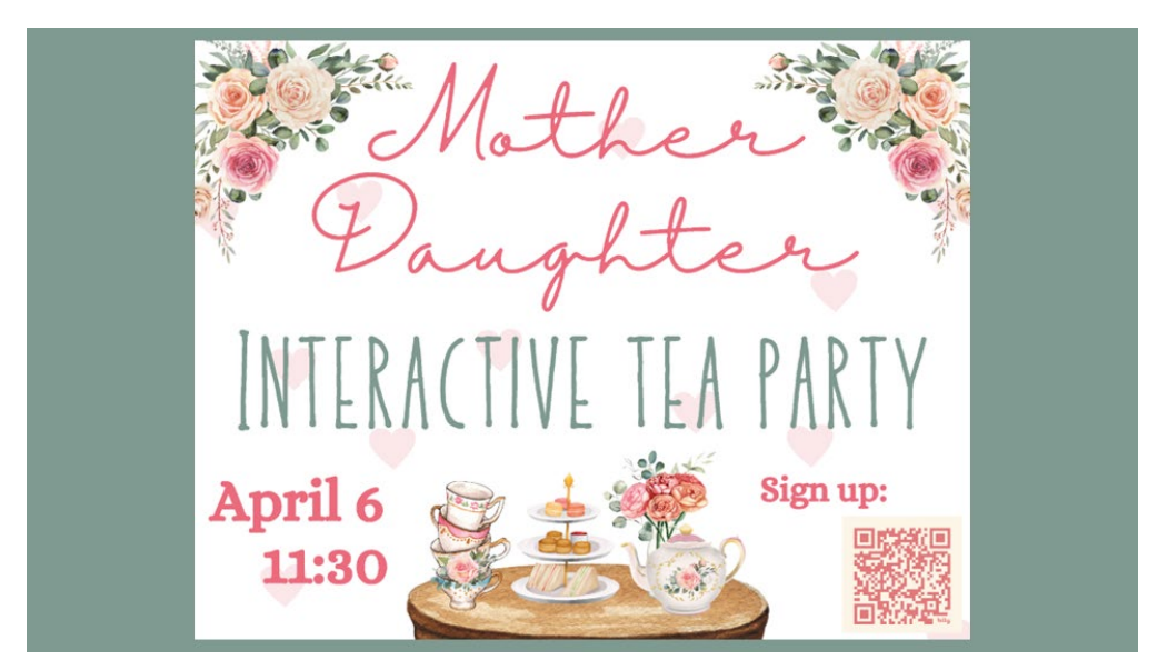
Sign Up Here!

For dates and to sign up: <a href="https://bit.ly/3ZVhyB8">https://bit.ly/3ZVhyB8</a>