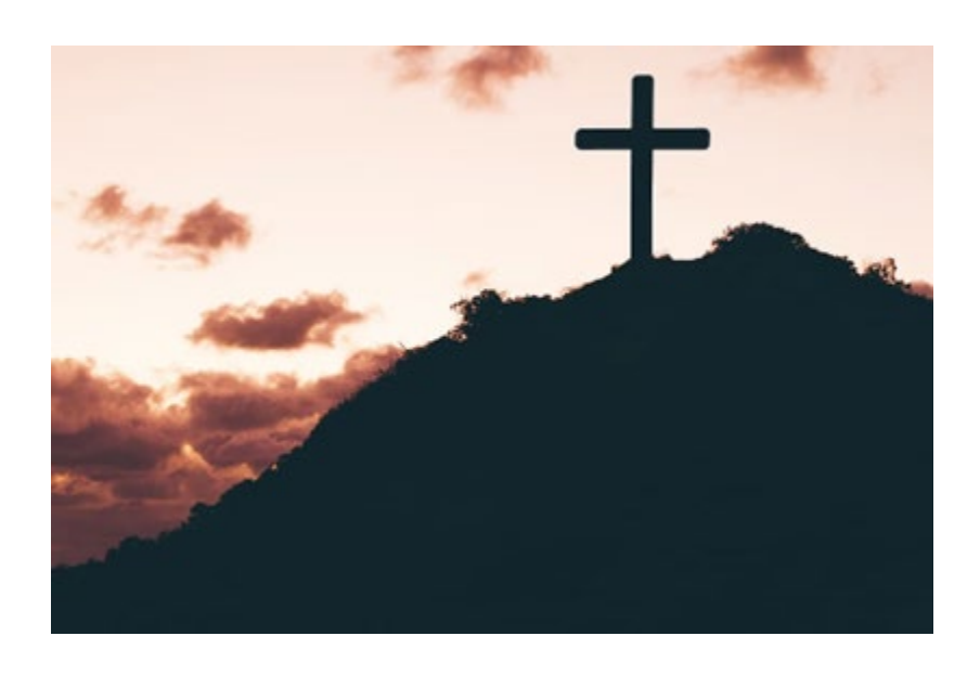
Pastor's Corner for March 31-April 6, 2024

Christ Is Risen (1 Corinthians 15:50-58)