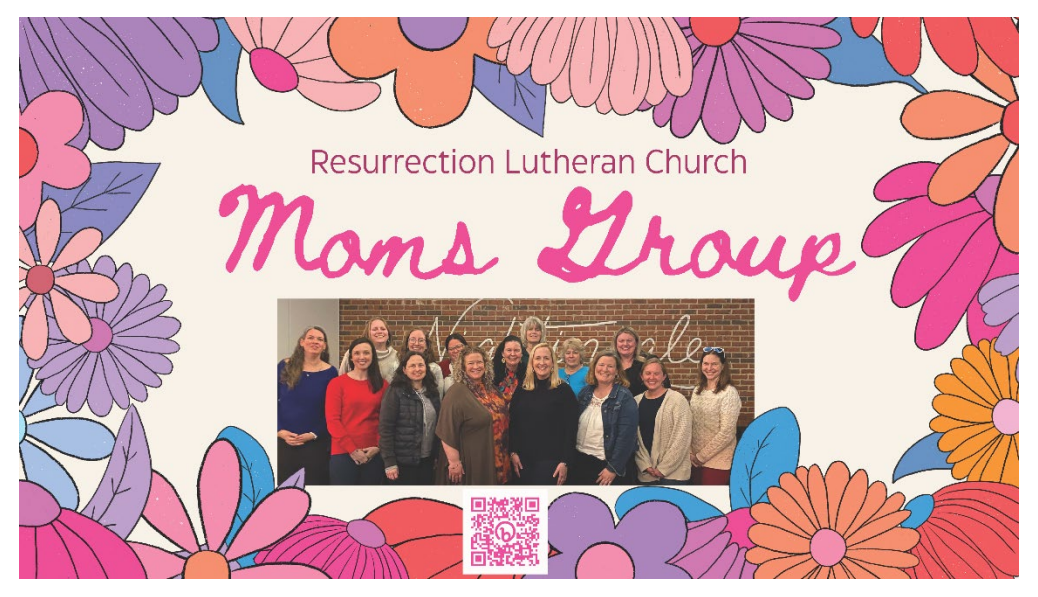
For dates and to sign up: https://bit.ly/3ZVhyB8

Childcare is available for a small fee. We also meet for evening activities occasionally.