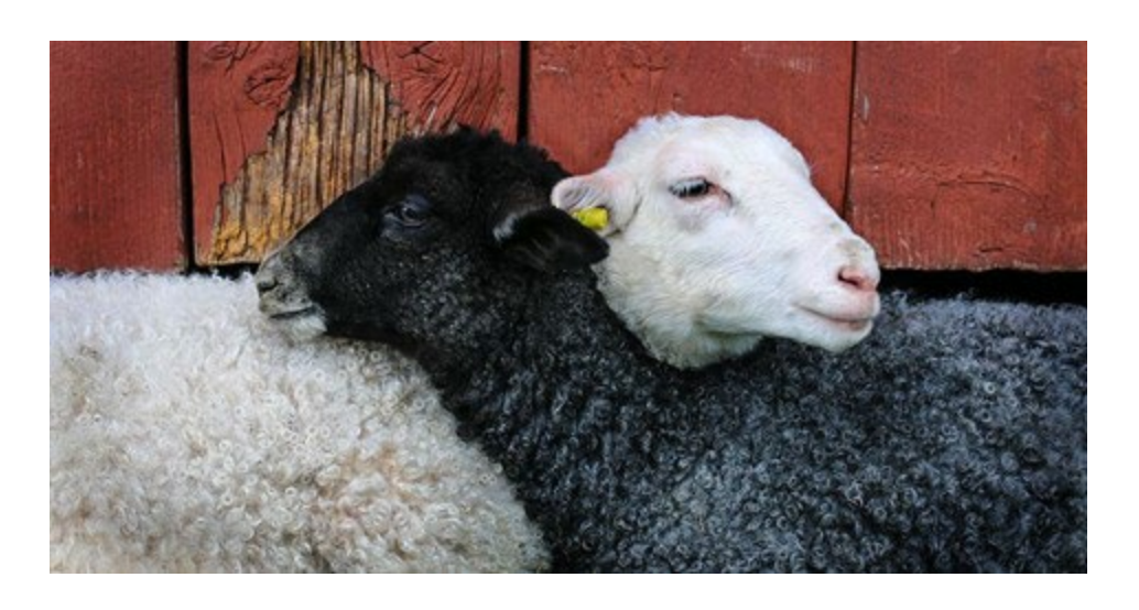
Pastor's Corner for April 21-27, 2024

The Lord Is My Shepherd (Psalm 23:1; John 10:11-18)