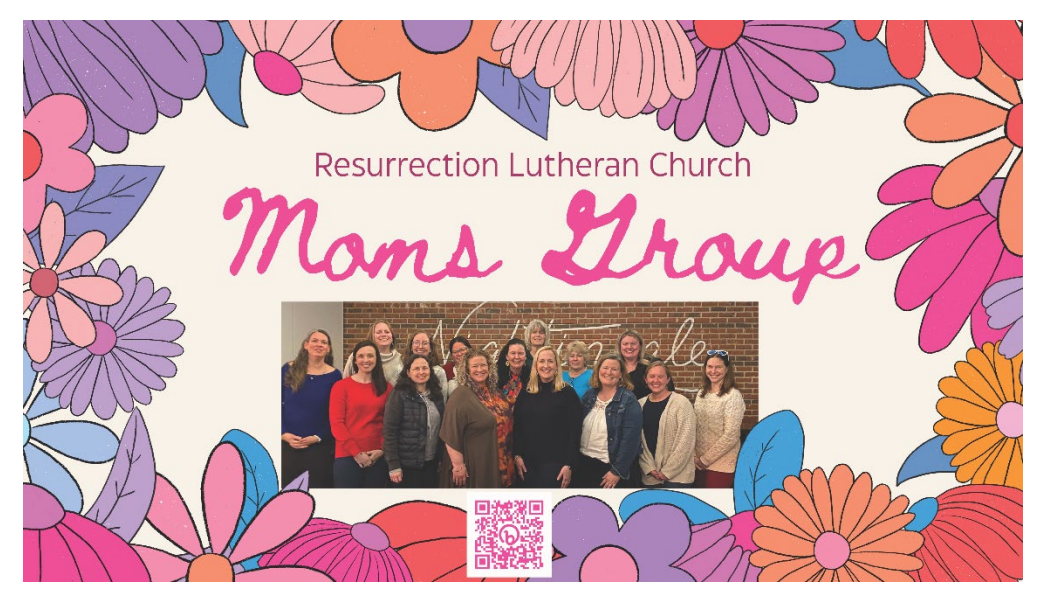
For dates and to sign up: <u>https://bit.ly/3ZVhyB8</u>