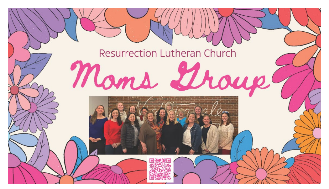
For dates and to sign up: <a href="https://bit.ly/3ZVhyB8">https://bit.ly/3ZVhyB8</a>