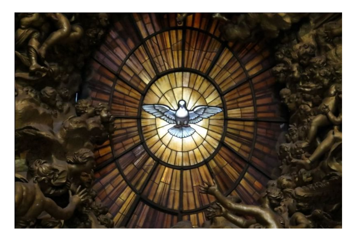
Pastor's Corner for May 19-25, 2024