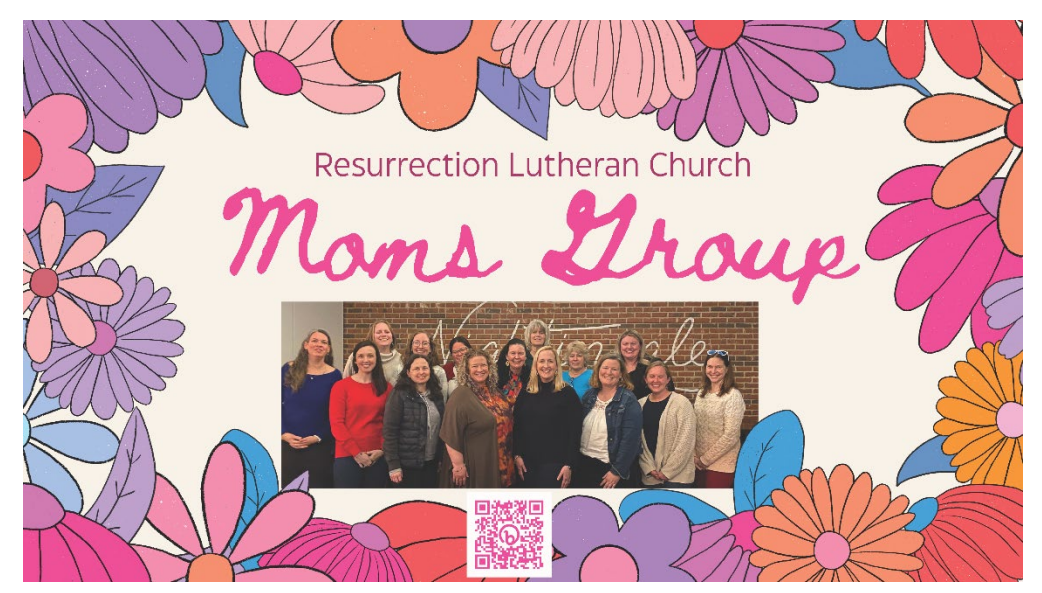
For dates and to sign up: <u>https://bit.ly/3ZVhyB8</u>

Vacation Bible School June 24-28 from 9:00 am-12:00 pm