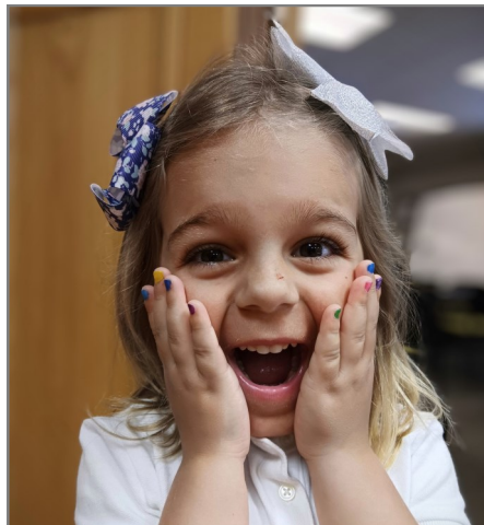
Two weeks until the FIRST day of school??