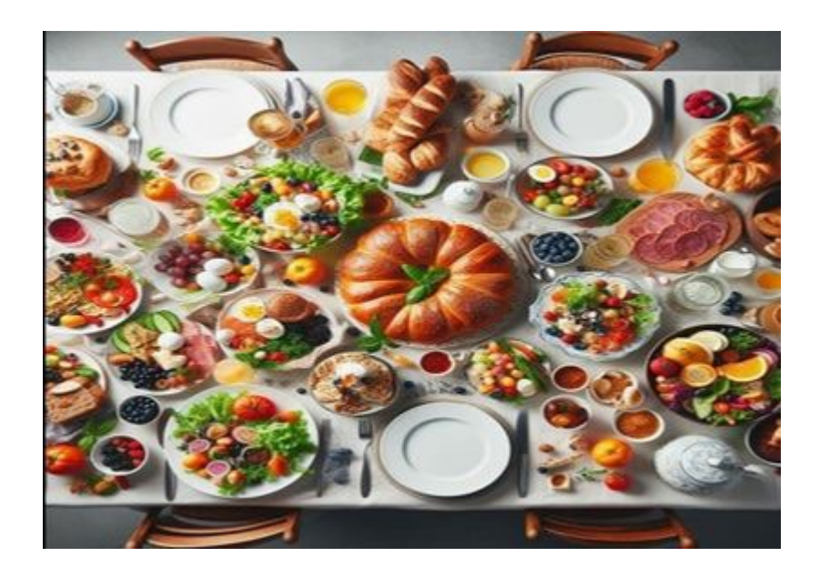
Pastor's Corner for August 11-17, 2024