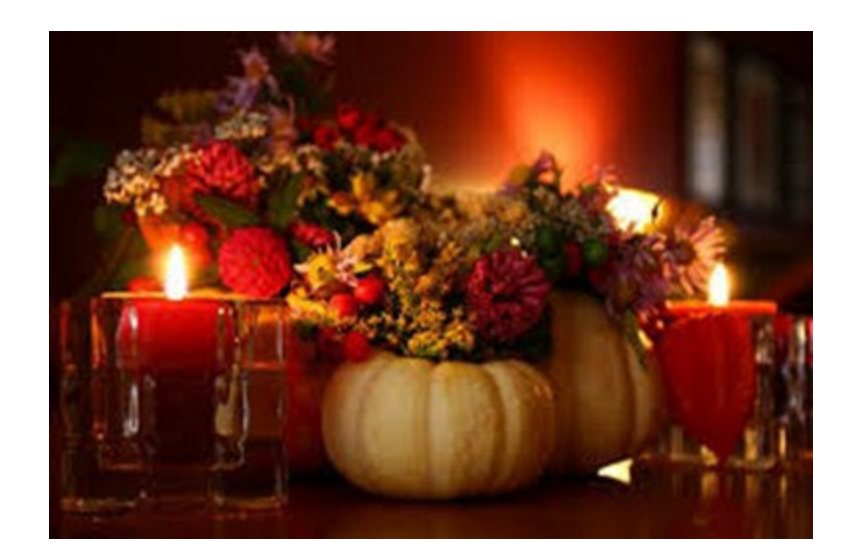
Pastor's Corner for December 1-7, 2024