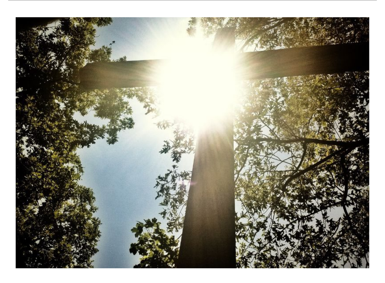
Pastor's Corner for January 5-11, 2025