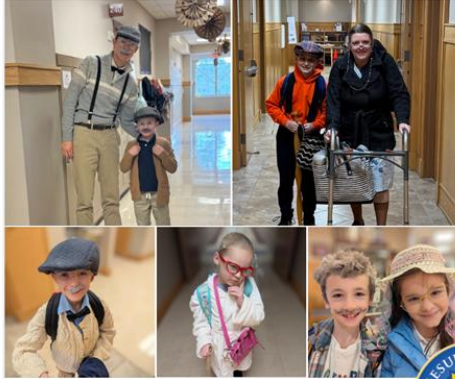
Day 1 of National Lutheran Schools Week 100th Day of School