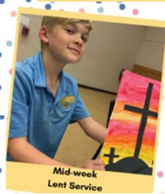
Mid-week Lent Service