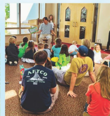
Thank you Pint Sized Pasture!!