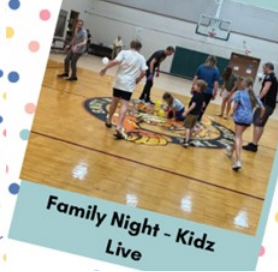
Family Night - Kidz Live