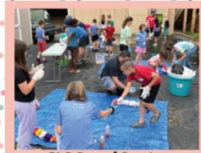
RLC Day of Service

It was an amazing event. We are thankful for your generosity.