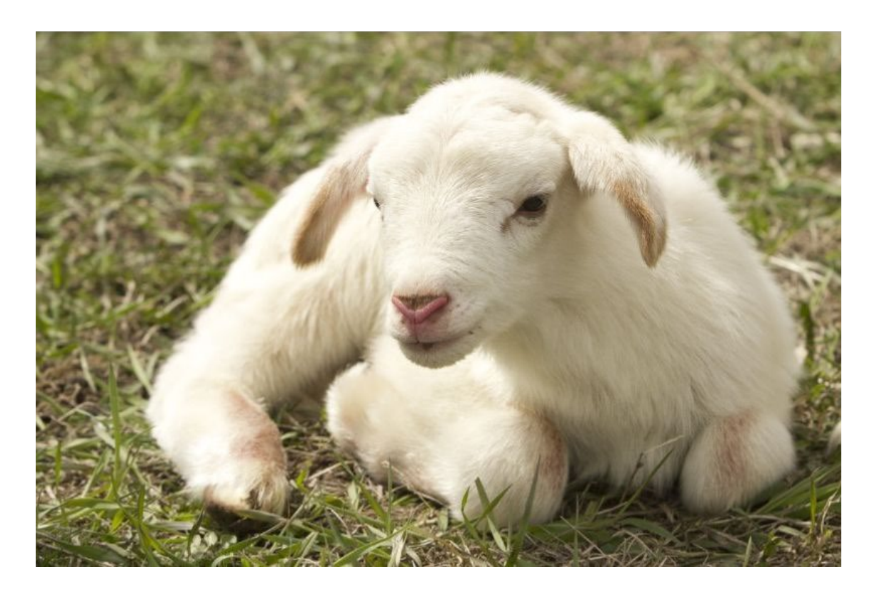
Pastor's Corner for May 11-17, 2025