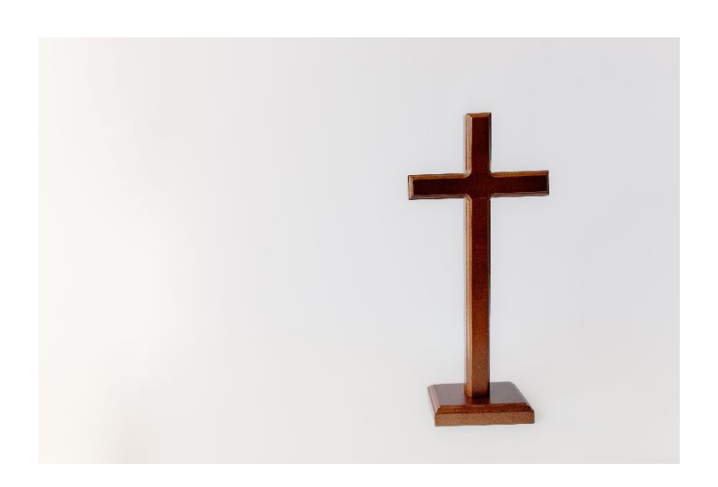
Pastor's Corner for June 8-14, 2025