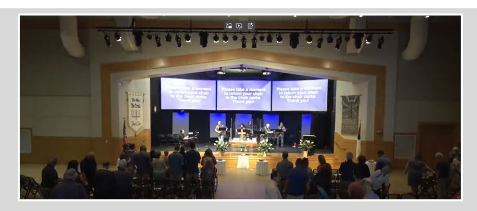
During the month of July, the 11:00 am Praise Worship Service will be held in the Sanctuary due to maintenance in the Family Life Center Gym.