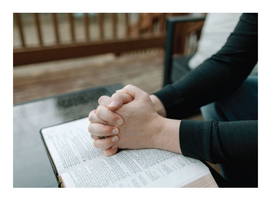
Pastor's Corner for June 22-28, 2025