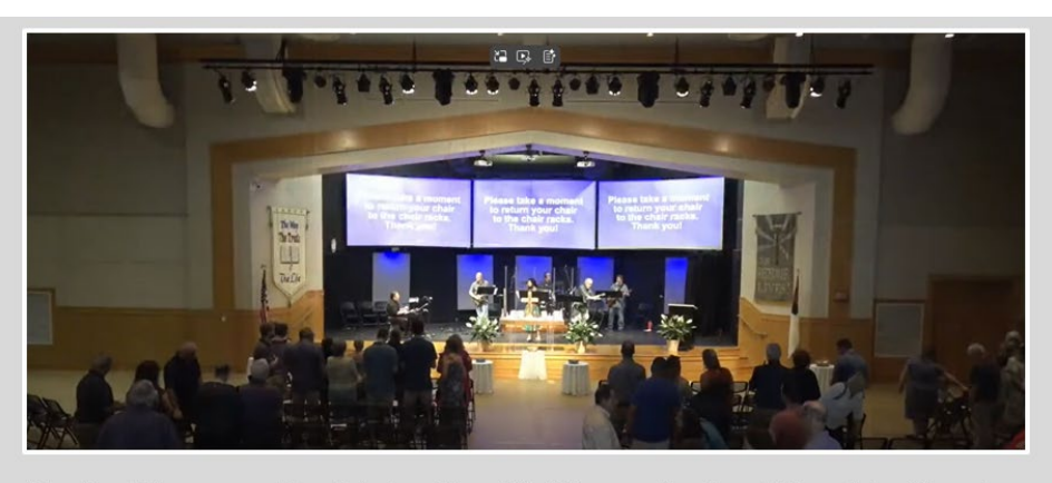
During the month of July, the 11:00 am Praise Worship Service will be held in the Sanctuary due to maintenance in the Family Life Center Gym.