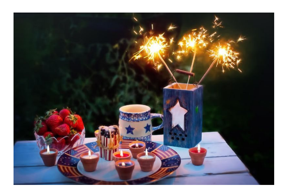
Pastor's Corner for June 29-July 5, 2025