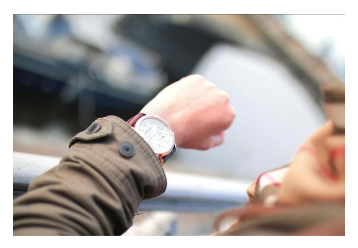
Pastor's Corner for November 10-16, 2024