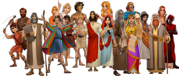
'People of the Bible'