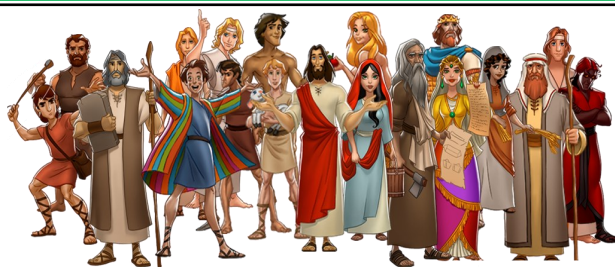
'People of the Bible'