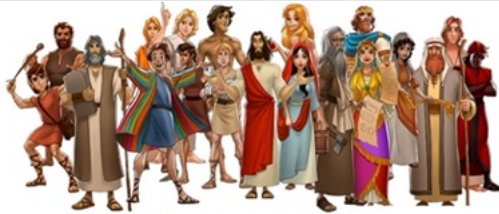
'People of the Bible'

Please join us in fellowship in Houg Hall immediately following each service. We will see you there!