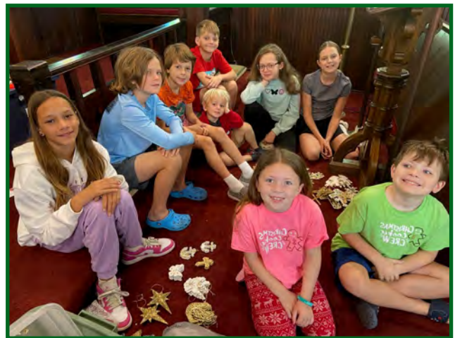
Talking about the meaning for each ornament as it relates to Jesus.

Following the tradition of “no Christmas trees in services during the Advent Season,” we all met in the church building on the day before Christmas Eve and decorated the Chrismon Tree. Our Chrismon tree was