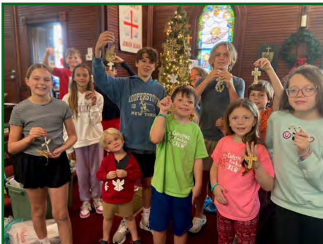
Our Sunday school helpers decorating the Chrismon tree with only religious ornaments.

Following the tradition of “no Christmas trees in services during the Advent Season,” we all met in the church building on the day before Christmas Eve and decorated the Chrismon Tree. Our Chrismon tree was