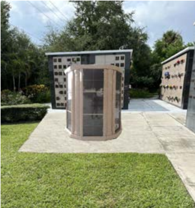
Artist's Rendering of New Columbarium

for the new Columbarium. This price ($2,160) is good through September 30, 2024, after which the price will increase. Come see Rebecca or Joyce in the Cemetery Office, Monday through Friday, 9 a.m. to 1 p.m.