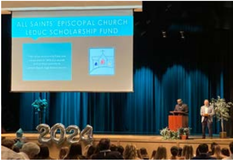
The 2024 Scholarship Awards Ceremony at the Jensen Beach High School

originally began as a loans program for those pursuing tertiary education. However, in 2003, the program changed to scholarships awards to Jensen Beach High School (JBHS) seniors. Through an annual grant from the GW Fund at the Community Foundation Martin - St. Lucie, private donations, and the interest of the LeDuc Fund, these scholarships have assisted several students in pursuit of college education.