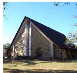
St Luke Methodist Church