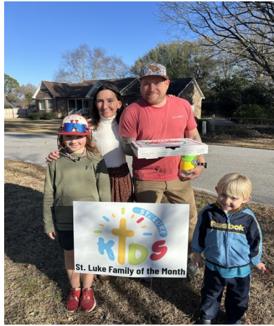
The Shaw Family