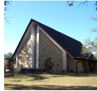
St Luke Methodist Church

You can pick up Holy Communion Packets in the church office. If you need them delivered to your home, please let the church office know (843-383-5169).