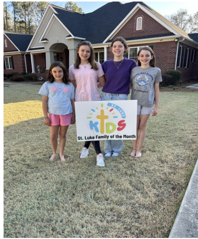
The King Family