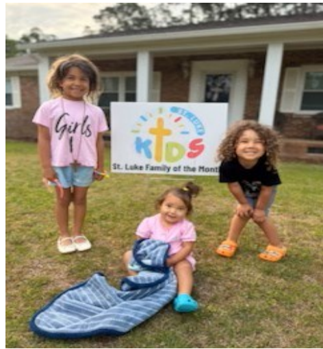
The Tyree Family