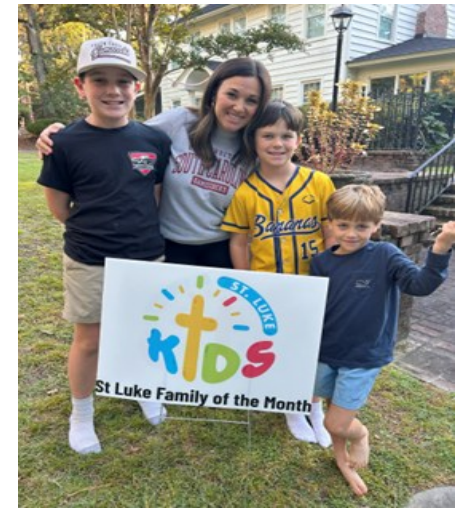
The Tingen Family