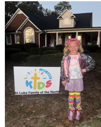
The Monk Family