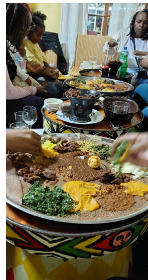
THE TEAM GAINED A WHOLE NEW UNDERSTANDING OF "FINGER FOOD." IN THIS CASE IT'S ETHIOPIAN FARE.

"The church was so welcoming. Young people are listening. There were so many young men and women there, as well as old, just praising the Lord. The singing was so amazing. It warmed my heart to be a part of it. Don't let age deter you!"