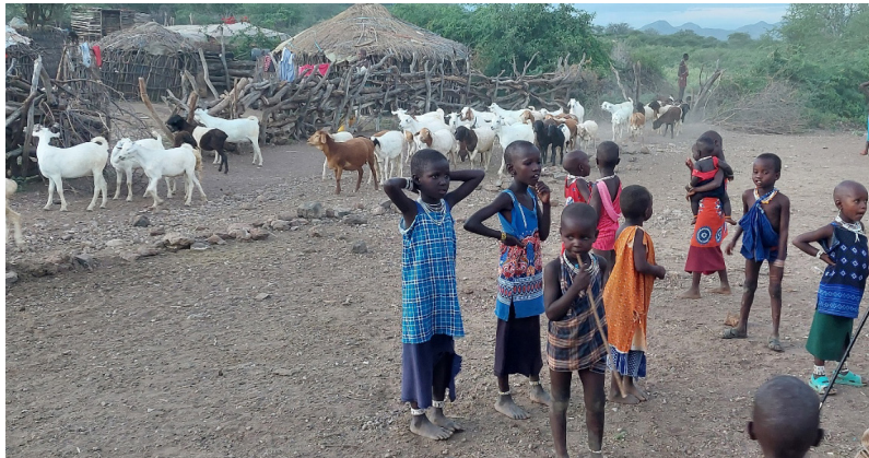
(BELOW) A MAASAI COMPOUND, GOAT HERD, AND CHILDREN.

(LEFT) THIS CHRISTIAN FATHER SAID HOW GLAD HE IS THAT HIS DAUGHTER CAN GROW UP AND GET AN EDUCATION, GOING AGAINST MANY CENTURIES OF HIS OWN CULTURE'S NORMS.