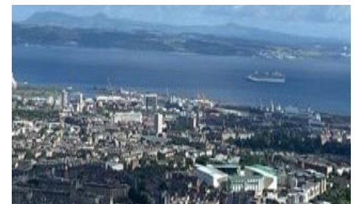
FROM A DISTANCE EDINBURGH LOOKS DECEPTIVELY FLAT- IT IS NOT. IT’S A PLACE IN NEED OF REVIVAL: OLD CITY, NEW CITY, THE “FIRTH OF FORTH” AND THE HIGHLANDS BEYOND.

FLAG OF SCOTLAND —When Saint Andrew was being crucified by the Romans in A.D. 60, it is said that he believed himself unworthy to be crucified on a cross like that of Christ. He met his end on a “saltire,” or X-shaped cross (St. Andrew’s cross).