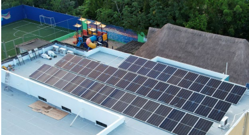
ROOFTOP SOLAR PROVIDES POWER FOR THE CANCUN COMMUNITY CENTER

SonLight Power equipped the Back2Back Cancun site with a new solar-power system to keep that program running strong.