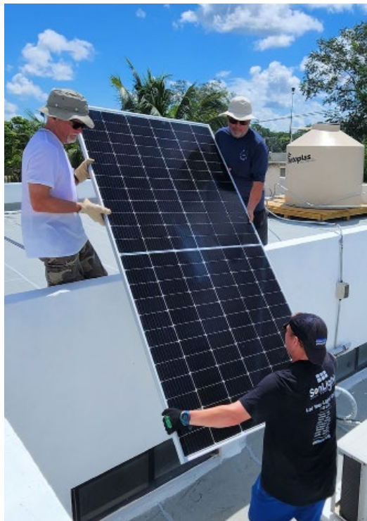
SONLIGHT POWER'S PARTNERSHIP AT WORK

What makes a partnership between SonLight Power and Back2Back work? Like-mindedness for starters. Two Back2Back staff members recently shared the short and long-term impact donors are making through the solar project in Cancun.