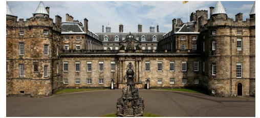
HOLYROOD PALACE AT THE BOTTOM OF THE ROYAL MILE IS KING CHARLES' EDINBURGH RESIDENCE & THE SCOTTISH ROYAL HOME.