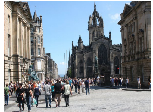
MIDWAY ON THE ROYAL MILE ARE TWO CLUES TO EDINBURGH TODAY. ON THE LEFT IS A HUGE STATUE OF ENLIGHTENMENT PHILOSOPHER DAVID HUME (1711-76), WHO DENIED GOD'S EXISTENCE. ON THE RIGHT IS ST. GILES CATHEDRAL WITH ITS FAMED CROWN SPIRE.

IN THE MID-1550s, ST. GILES WAS THE HOME OF REFORMER JOHN KNOX, A DISCIPLE OF JOHN CALVIN OF GENEVA. KNOX FOUNDED THE PRESBYTERIAN CHURCH OF SCOTLAND THAT GAVE BIRTH TO THE PRESBYTERIAN CHURCH IN AMERICA.