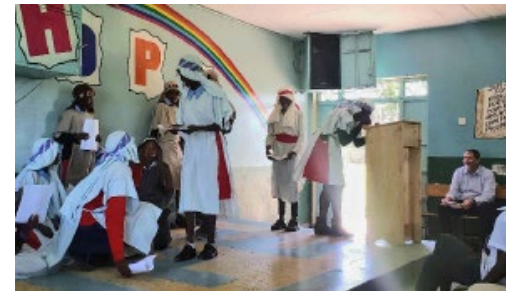
THEY PERFORMED A SKIT OF THAT BIBLE STORY. (I'M THE COACH ON THE BENCH.)

Sunday worship was a time for the kids to share some of what they had learned and to dance for God. I helped with a group of kids, teaching about Jesus feeding the 5000, and walking on water.