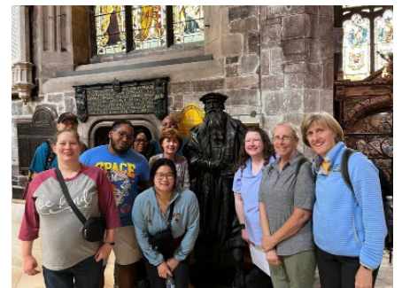
THE TEAM VISITED KNOX'S MEMORIAL AT ST. GILES. HIS BURIAL PLOT IS UNDER THE PARKING LOT.