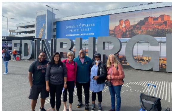
WE HAD PLANNED FOR MONTHS. WE WERE SO GLAD TO FINALLY GET TO SCOTLAND.

ENJOY THESE PHOTOS FROM THE TEAM'S SCRAPBOOK