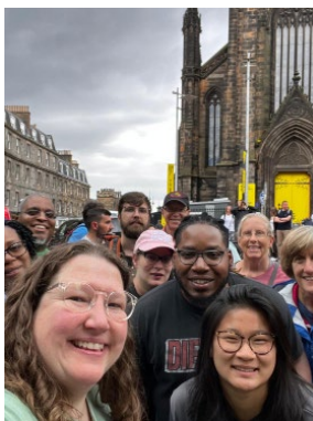
FIRST DAY PRAYER WALK IN THE HEART OF THE CITY ON THE ROYAL MILE

We had a good number of positive interactions through a