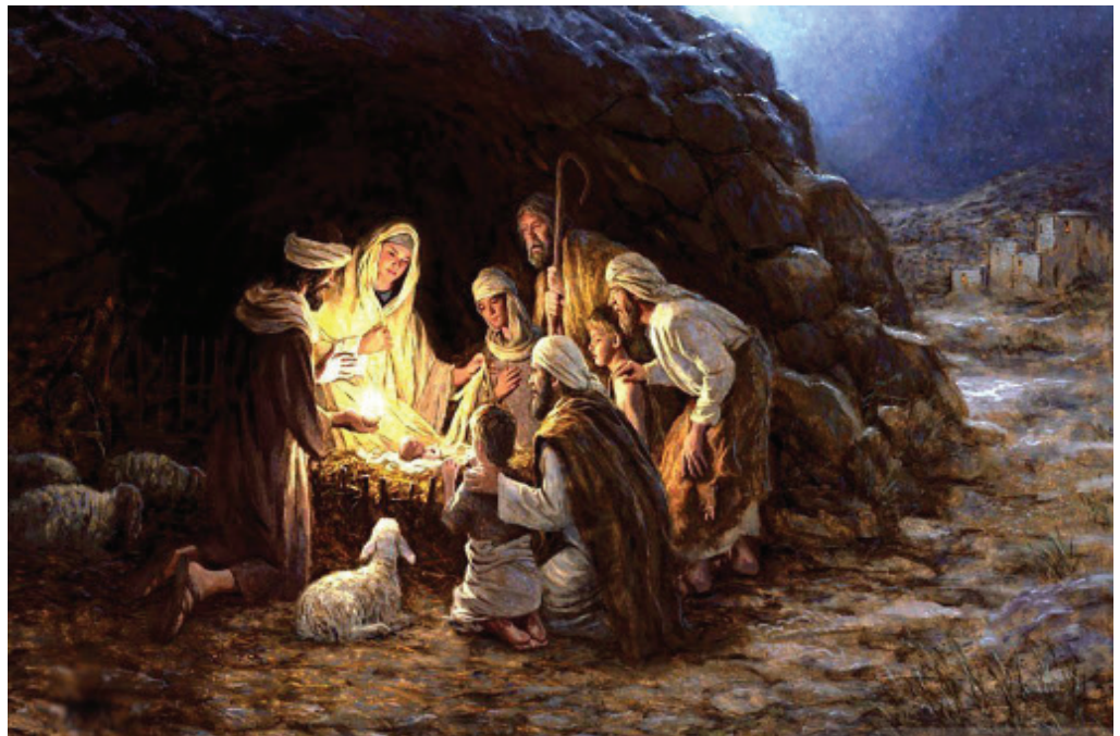
ADVENT SPIRITUALLY PREPARES BELIEVERS FOR THE MOST SIGNIFICANT ARRIVAL IN ALL OF ETERNITY — JESUS, THE CHRIST, BEING BORN IN THE FLESH...GOD WITH US.

At the time of Jesus' birth, Bethlehem had a population of about three hundred. It was the area of lush fields and natural caves where Levitical shepherds raised lambs for sale as sacrifices at the Temple in Jerusalem. These special shepherds were trained for and tasked with the responsibility of discerning which lambs were suitable for sacrifice, since only unblemished lambs were